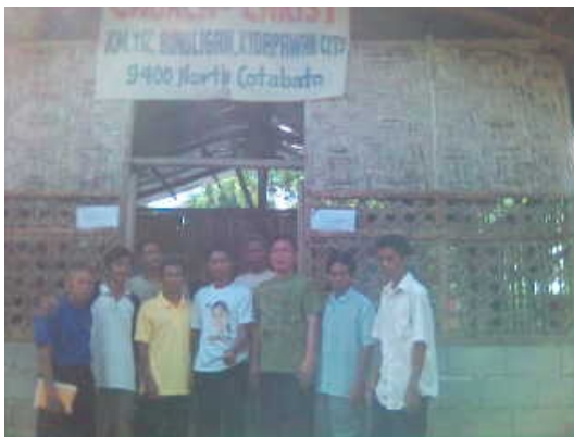
One of 7 congregations in North Cotabato, Philippines.