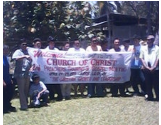
One of 2 congregations in Zamboanga North, Philippines