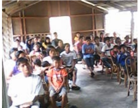
Gospel meeting at Lake Sebu, South Cotabato, Philippines. 7 congregations present.