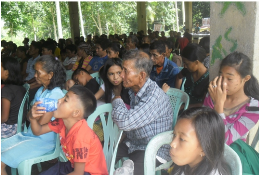
Gospel meeting at Camp Bulatukan, North Cotabato, Philippines, in 2011. Attendance 887; congregations present: 27; baptisms: 218.