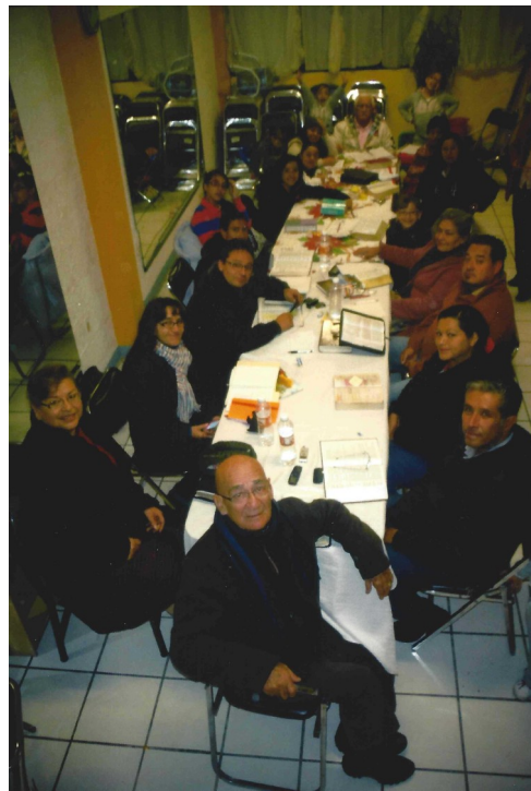
Above: Pachuca, Mexico. Bible study. All others : News photos of the flooding in the Philippines.