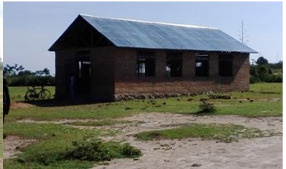
New church building at Mugeta, Tanzania