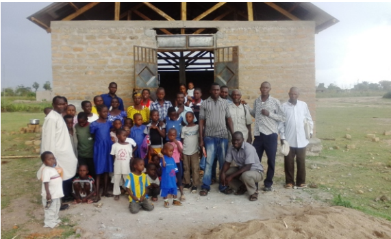
Congregation with new church building at Mugeta, Tanzania