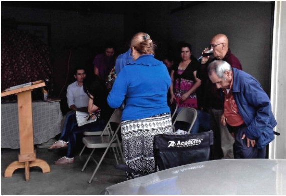
New congregation in Olmito, TX