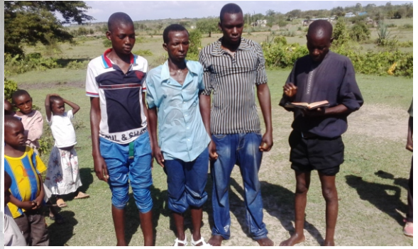
Three baptisms in Mugeta, Tanzania